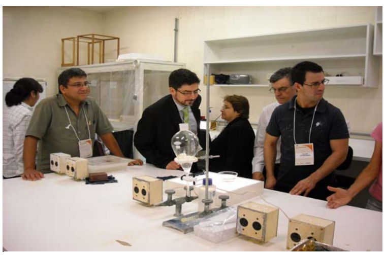
Participants visiting CETESB facilities during the workshop

The round of workshops on this topic was initiated in 2009 and is expected to be concluded by the end of 2010. Follow-up activities are currently being planned. For further information, please visit our homepage.