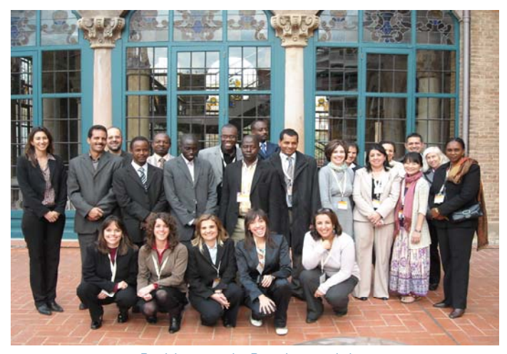
Participants at the Barcelona workshop

The national projects aim at raising awareness on the risks and problems related to new POPs and at identifying available options for their sound management in order to offer a solid foundation to decision-makers and other national stakeholders to take informed decisions regarding a future risk management strategy on new POPs, including the ratification of the amendments to the Convention.