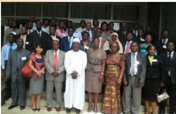
Group picture of the participants attending the regional workshop

The regional workshop was followed by a national workshop on the nine new POPs and implementation of the Stockholm Convention in Nigeria held in Abuja, from 23 to 24 August