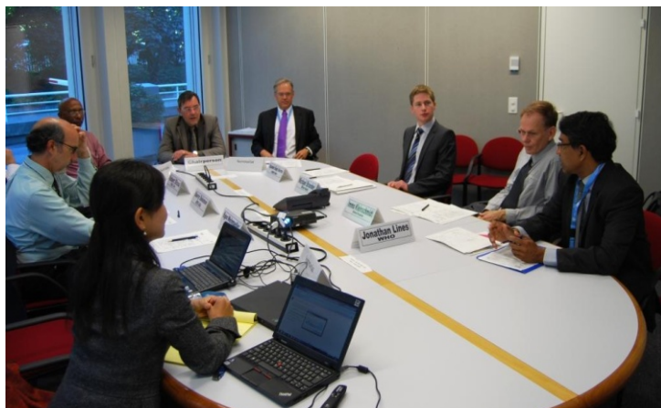
The core team having a roundtable deliberation

assuring reduced malaria disease burden. The work is implemented under five specific themes: cost-effectiveness of alternatives to DDT; strengthening of in-country decision-making on IVM; malaria vector resistance patterns and mechanisms; reducing barriers to bring new chemicals and products to market; and new non-chemical products into use.