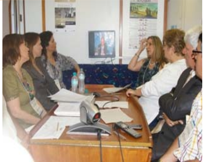
The press conference seen from the Sea Dragon