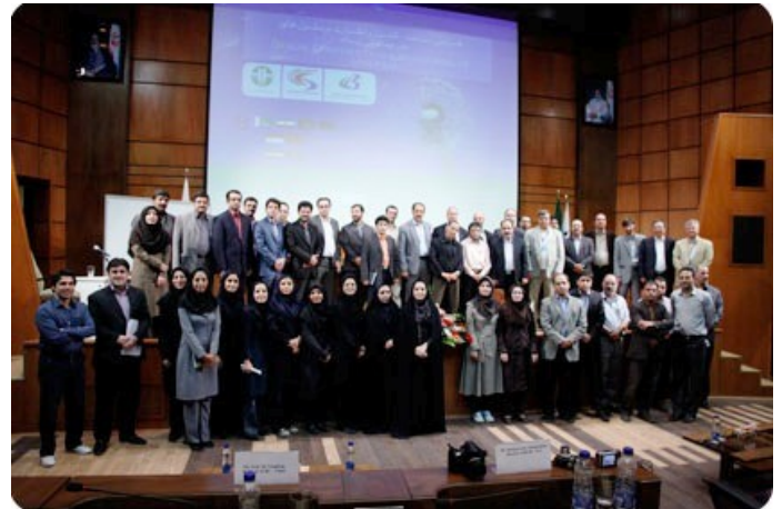
Participants during the workshop

The objective of the workshops was to improve and update the knowledge of participants in the field of design, construction, operation and monitoring of landfills on one hand; and in minimization and management of hazardous wastes and