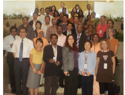
Participants during the Stockholm/Rotterdam capacity-building workshop, Sri Lanka, January 2011

ized with the Rotterdam Convention to bring together members of the POPRC and the Chemical Review Committee;